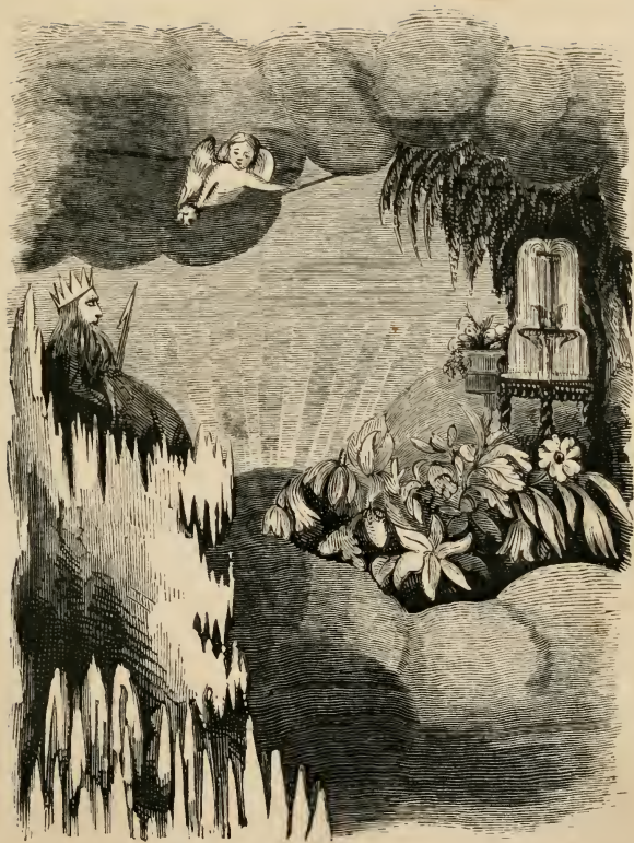
The Frost King's Palace.